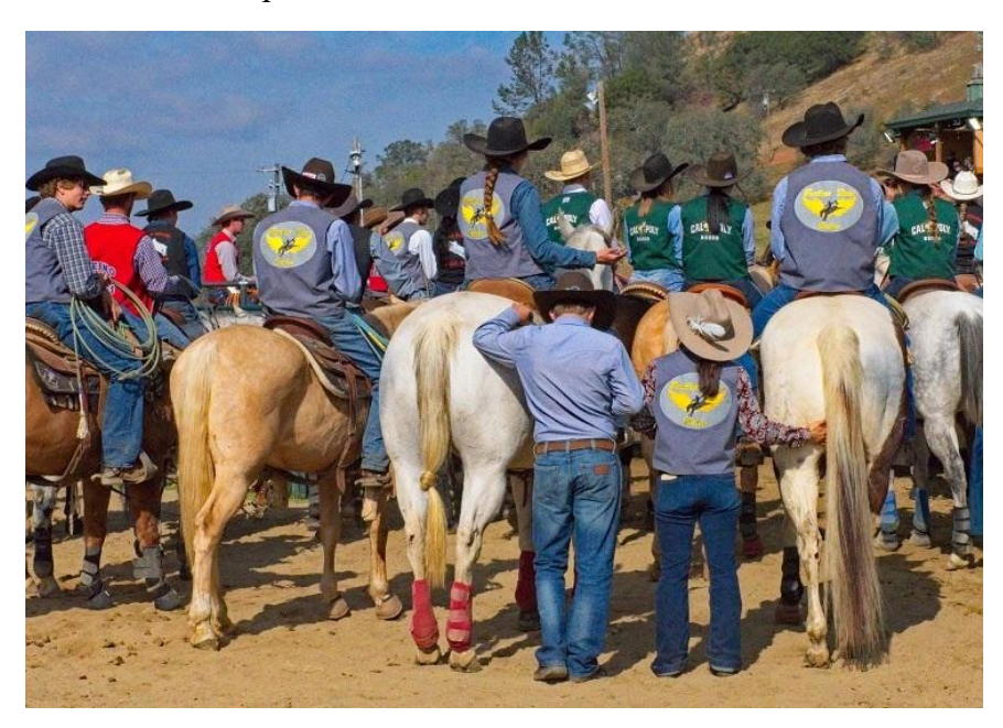
Above photo taken by Nikki Saurman shows community Feather River Rodeo Athletes

With weeks and even months of preparation, you will find each Feather River Rodeo student working hard at the fairgrounds to clean up the facility and put together a beautiful arena and ground for our equine and human athletes to perform in.