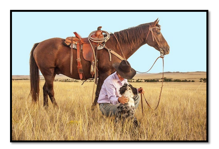
Cowboy horse dog. <u>Click here to go to image source.</u>

The second way you can release some anxiety is to once again, clear your mind, and envision each thing you need to do with your body during your competition over and over again until you know exactly what needs to be done and your muscle memory will match up with your mind. Finally, talking about your fears or anxieties out loud before a game or competition or even writing them down can help you mentally get rid of them and talk out how you can overcome them. Sometimes, when you hear your fears and worries out loud, they may not seem as significant and may diminish as you hash them out.