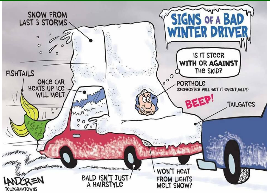
Click here to go directly to this photo online

Follow these simple rules during the winter season to save your life and help prevent avoidable accidents.