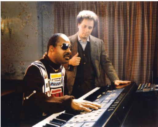
Stevie Wonder and Ray Kurzweil

Stevie Wonder, American singer, songwriter, musician and record producer was born six weeks prematurely with a condition known as retinopathy, which lead to his blindness shortly after birth. A musical prodigy, Wonder taught himself to play the piano, harmonica, and drums. He signed his first record deal at the age of 11, and at age 13, became the youngest artist to have a Billboard Hot 100 hit.