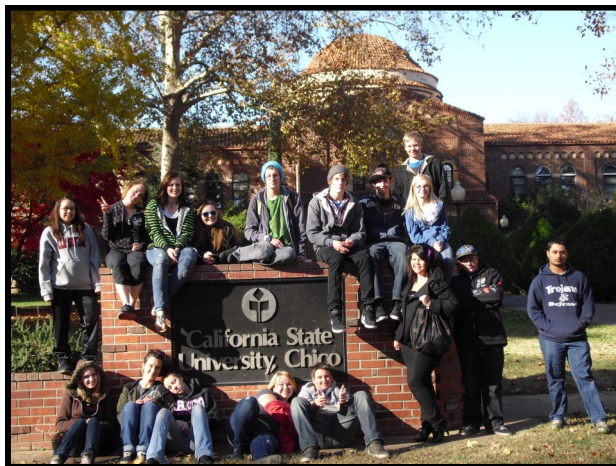
17 students attended a tour of Chico State University during the December academy. Students also visited a photography exhibit in the University Art Gallery and a Holiday Faire at the fairgrounds.