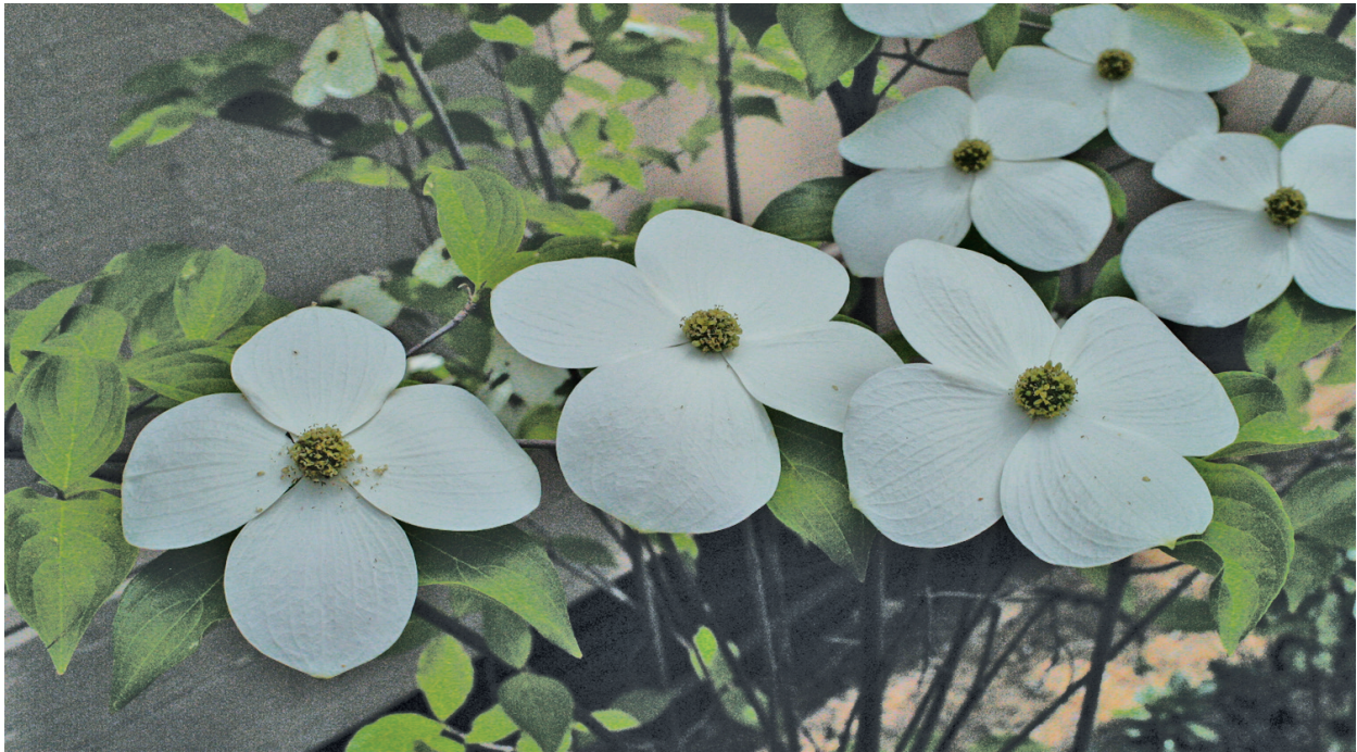
Cornus californica California Dogwood