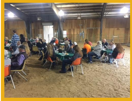
Bachelor degree graduation luncheon

End of the year activities at FRC Climbing Wall attracted local rock hounds of all ages