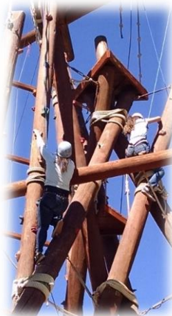
One of the many brave students who took the "Leap of Faith" by climbing the tall pole and jumping from the platform to hit the suspended punch bag before being lowered to safety by trusted classmates.