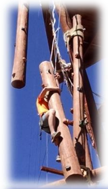
Students conquered the "Alpine Tower" while trusting their classmates and camp/ETS staff on the ground to keep them safe.