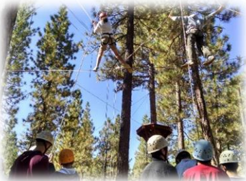
Freshmen transferred places with a partner on the "High Wires" while classmates belayed on the ground below to ensure their safety.

On September 14 th and 15 th , FRC's Educational Talent Search program hosted its annual two day "Freshman Focus Camp" for 45 of its 9 th grade ETS participants. Students took part in the many exciting and challenging activities at Grizzly Creek Camp near Portola and spent time looking to their future educational and career goals. Discussions were held on over-coming barriers to success and the availability of financial aid for various types of post-secondary education.