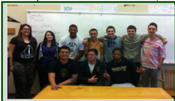
FRC Football players visiting Portola High School

Feather River College provides high-quality, comprehensive student education and opportunities for learning and workforce preparation in a small college environment. The College provides general education, Associate's Degrees, certificates, transfer programs, and life-long learning for a diverse student population by serving local, regional, national and international students through traditional face-to-face instruction as well as distance education. The College also serves as a cultural, and economic leader for all communities that lie within the District and embraces the opportunities afforded by its natural setting.