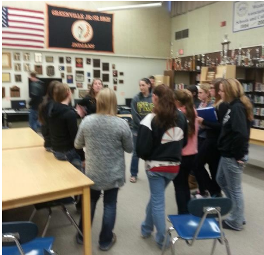
Greenville discussions between FRC athletes and high school students

Approximately 40 participants enjoyed the session in Greenville. The high school students stayed late to speak with FRC athletes for over 25 minutes. “A complete success at Greenville,” reported Merle.