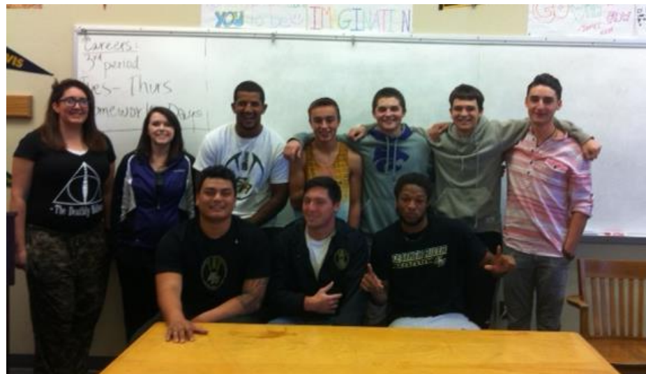
FRC football players visit Portola High School